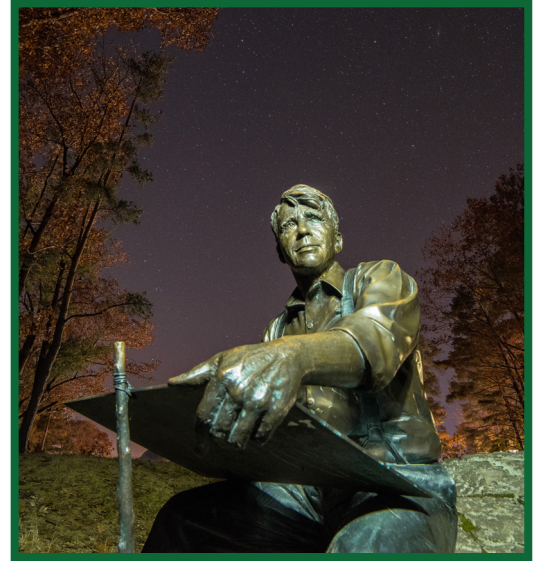
Robert Frost